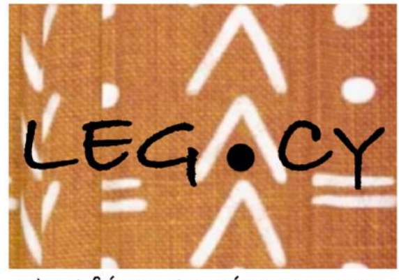
The African American Journey Transylvania County and Beyond

A story of struggle, A story of strength.